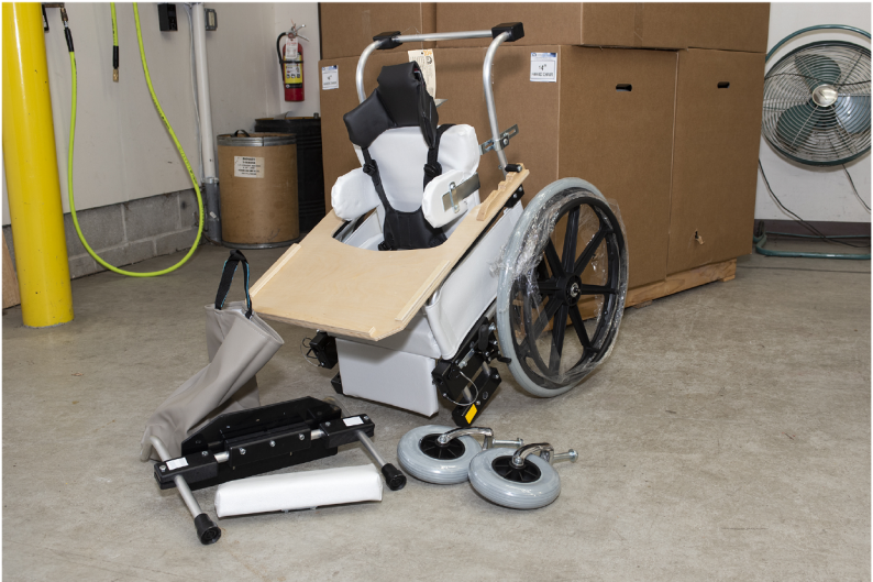
The finished chair and all its possible attachments.

We have community volunteers from three different area churches currently helping in the workshop. We are in need of some more volunteers, however. To get an idea of what is involved the following picture sequence should help fill in the story.