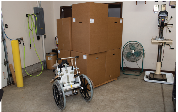
The chair with the included components ready to be boxed, and then the boxing of the chair.