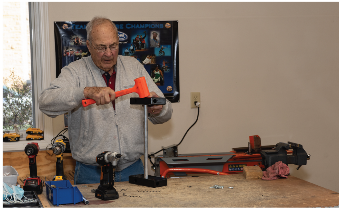
Assembling the chair frame and frame sub-assemblies.